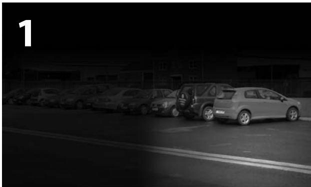
IR camera view

See the images below. In image 1 the IR camera can highlight the red car and that is it, however the same area when viewed by the NiteDevil technology (in image 2) can see a much wider and longer scene. The NiteDevil camera is actually getting all the light it needs for this from moonlight.