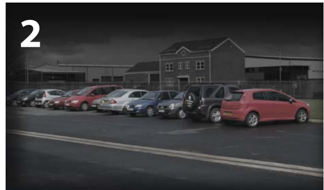
NiteDevil camera view

In these pictures the moon is three quarters full in both examples. These are actual video clips of NiteDevil actual video performance using only moonlight as the source of illumination on the NiteDevil website: www.nitedevil.com